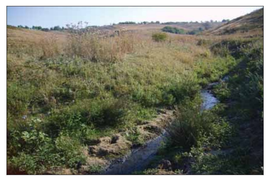
Figure 2. The area of limno-reocrene springs supplying the streams in the upper sector of the Preajba Valley hydrographical basin. Figure 2. Zona izvoarelor limnoreocrene care alimentează pâraiele din sectorul superior al bazinului hidrografic Valea Preajba (original).